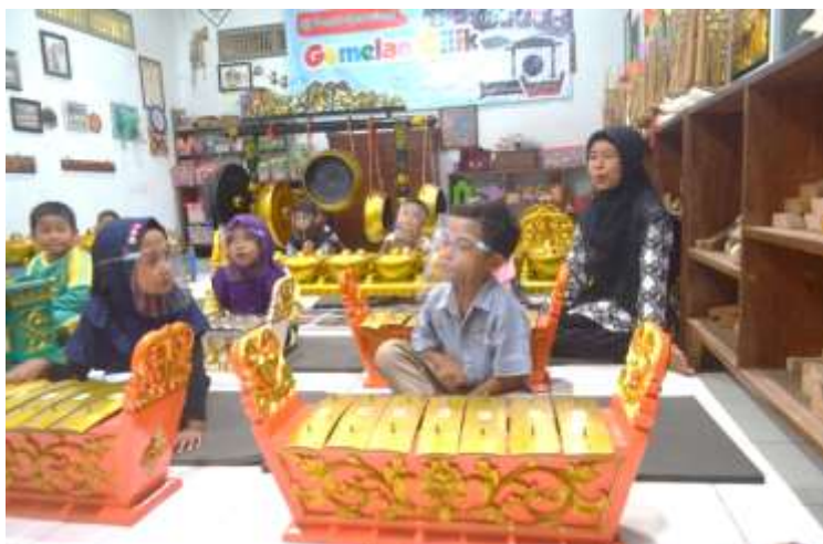
Figure 1. Parents provide assistance to children when playing little gamelan

The role of parents is very big influence on the success of students in learning. According to Lestari (2012) the role of parents is the methods used by parents regarding the tasks that must be carried out in raising children. Based on this understanding, it can the role of parents is the way parents are used in relation to their roles, which must be carried out in accordance with their duties because parents are the guide for the child. In this case, the behavior of parents who support children in learning activities based on local culture of little gamelan affects children in increasing motivation to learn little gamelan.